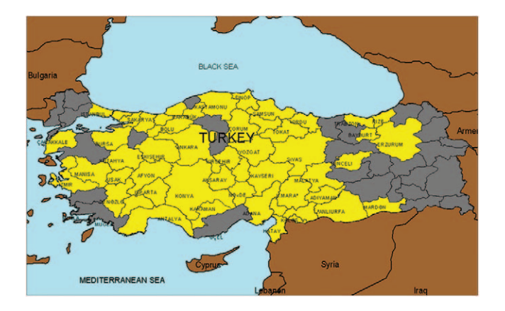
Figure 2. Distribution by city of the orthodontic patients who applied for treatment to Konya Selcuk University, Faculty of Dentistry, Department of Orthodontics.

The subject of this study, SUDO, established in 1988 in Konya in Central Anatolia, not only fulfills the orthodontic treatment needs of local people in Konya but at the same time it offers services to neighboring cities outside Konya. Some of the patients from distant cities are students at the university but most of these patients travel a long distance to receive orthodontic treatments in SUDO. However, the fact